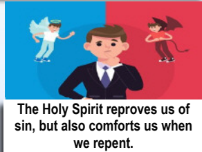
The Holy Spirit reproves us of sin, but also comforts us when we repent.

11) What will the comforter (Holy Spirit) do through our conscience on a day to day basis as we receive him? -John 16:7, 8. 1 - The "comfo__ter" (Holy Spirit) will "r__prove the w__rld on s__n, and of r__ghteousness and of j__dgment."