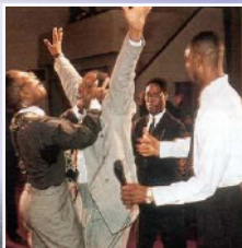
Beware of counterfeit tongue speaking in churches!

*Note: The gift of tongues given on the Day of Pentecost was for the purpose of spreading the gospel to the heathen nations who did NOT speak the Hebrew language. Every nationality miraculously heard the gospel in their own language. This was quite DIFFERENT than the tongue speaking that goes on in charismatic churches, today. The tongues that many Christians experience in our present time is a gibberish tongue that no man can understand and it is NOT beneficial to the mission of the gospel. This is NOT the tongues that the Apostles experienced, but is a COUNTERFEIT!